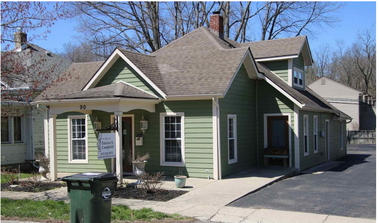
Figure 3 Property with Old sign