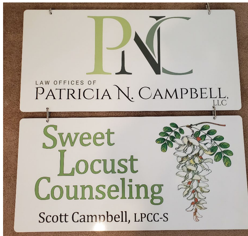
Sign Design Example 1