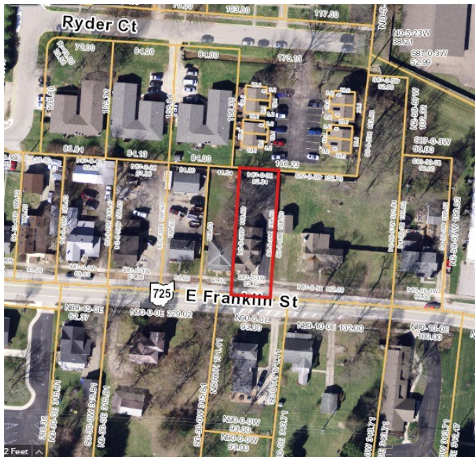
Figure 1 Location Map