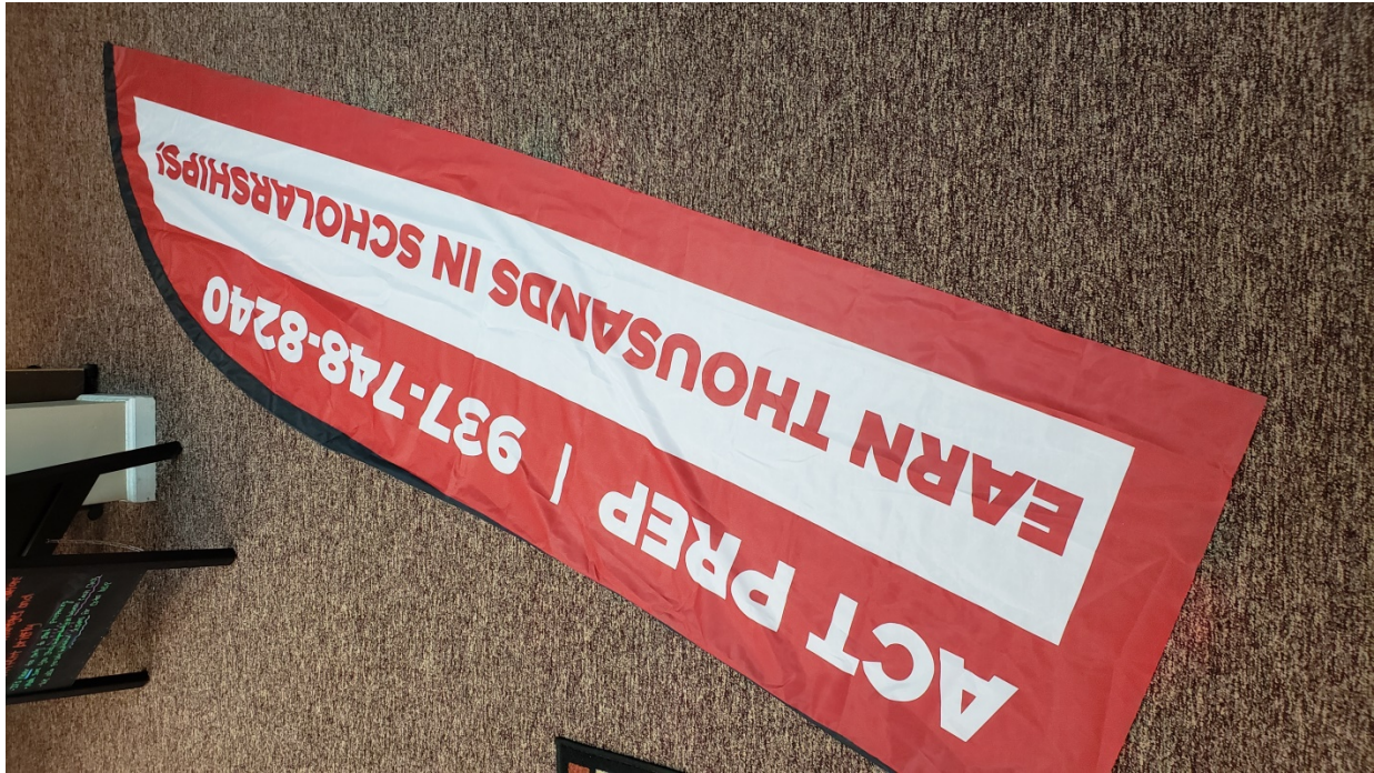
Photo of the Property