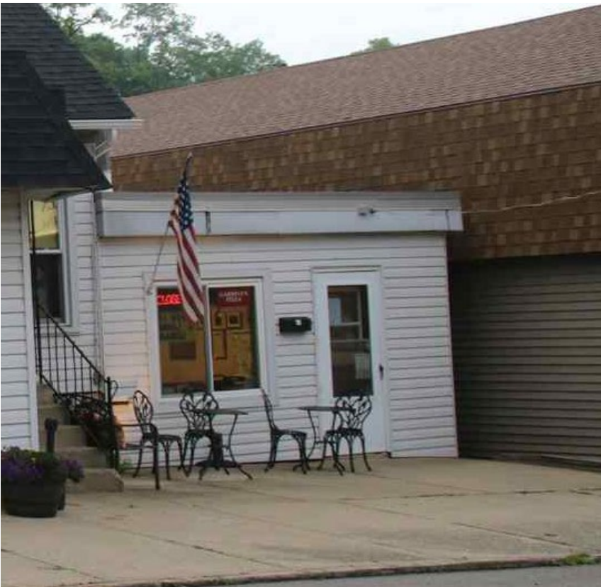
Figure 2 Property