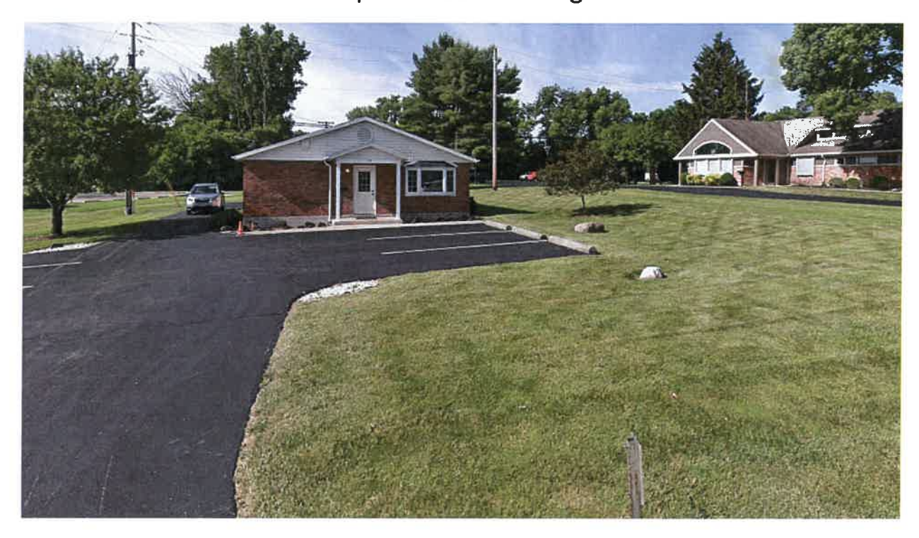
Existing Building Without Pretek Group Sign From E Franklin St