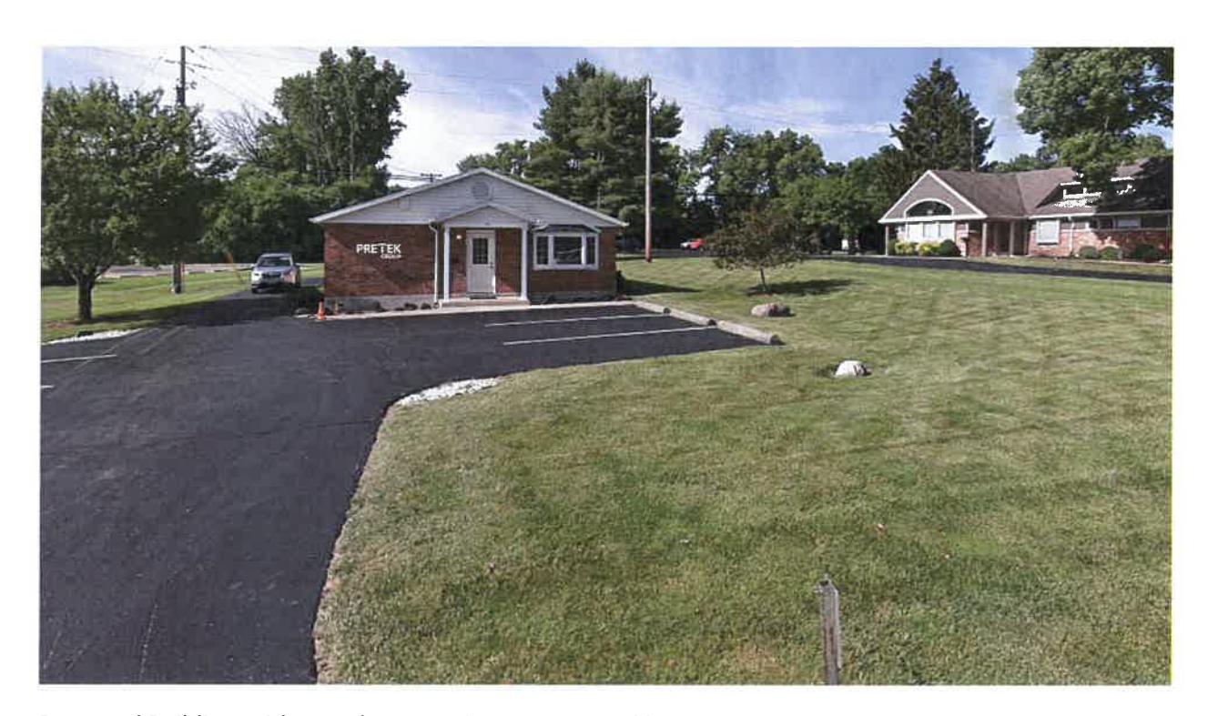
Proposed Building With Pretek Group Sign From E Franklin St